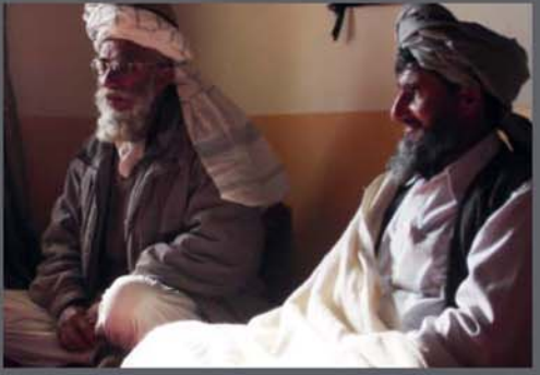
"LAWYERS IN THE WORLD - Afghanistan" by Ranwa STEPHAN, produced by Cocottesminute productions, With the support of Rhône-Alpes region.