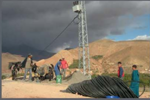
"TEA OR ELECTRICITY" by Jérôme LE MAIRE, produced by Iota Production, with the support of the French-speaking Community in Belgium